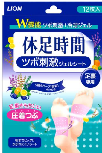
Kyusoku Jikan Cooling Foot Gel Pad (12 Sheets)