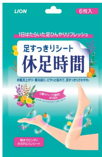
Kyusoku Jikan Cooling Leg Gel Pad (6 Sheets)